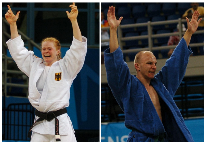
Fig. 3. Pride expression in response to victory shown by a sighted ( left ) and congenitally blind ( right ) athlete.

blind, and congenitally blind individuals across cultures. In all of these analyses, success had a large effect on the display of pride-relevant behaviors (39), which could not be attributed to a third-factor personality variable or to shared variance with facial expressions of happiness.